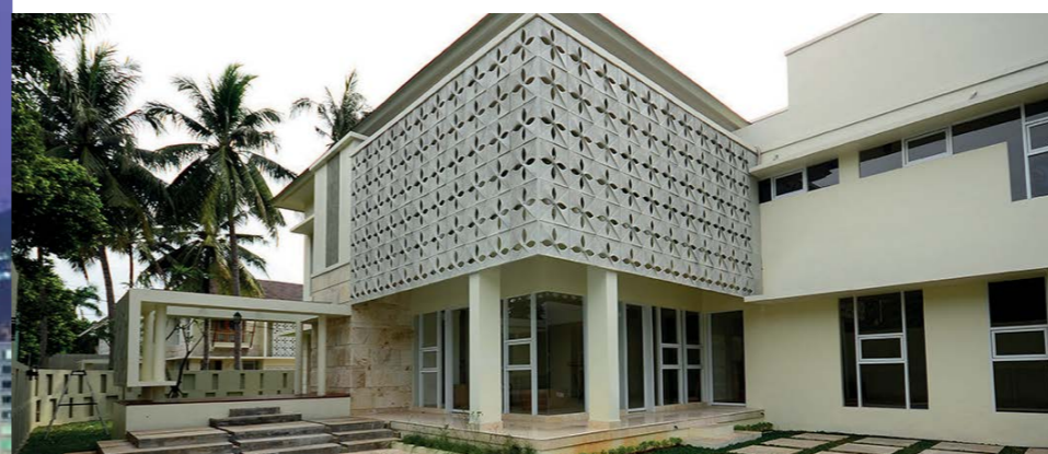
Bandung, Office Building