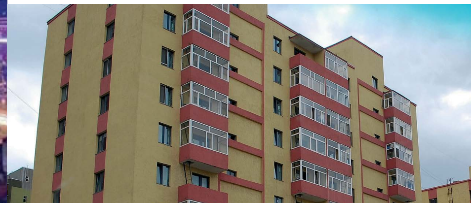
Cosy Village in Ulan Bator