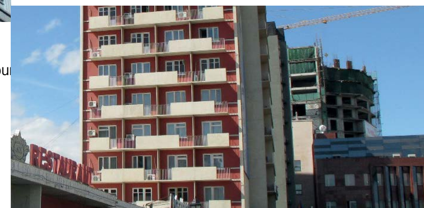
High-rise Residential Buildings in Ulan Bator

Fresh air is provided to users on each floor, while equipped with efficient heat exchanger.