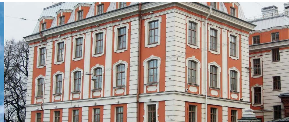
St. Petersburg Museum

Modular air processing units with centralized ventilation are adopted in the exhibition hall to create a constant temperature and humidity indoor environment. .